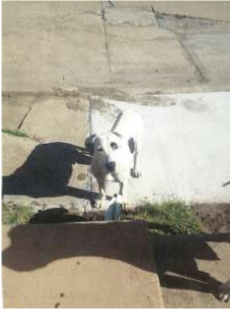
Stray missing an ear