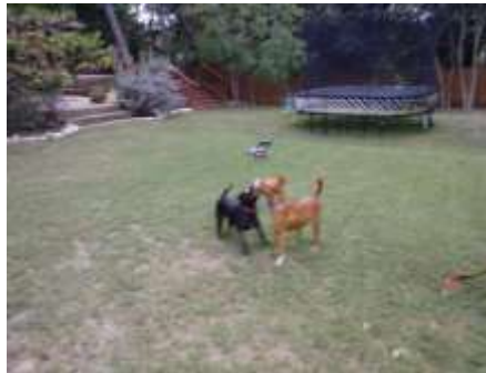
Cinnamon and Coco