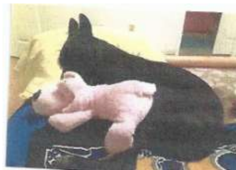
Cola having sweet dreams